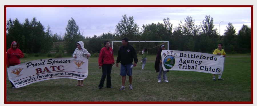
BATC Soccer Championships Battlefords Agency Tribal Chiefs