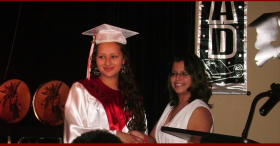
BATC CDC High School Scholarship Grant Little Pine First Nation