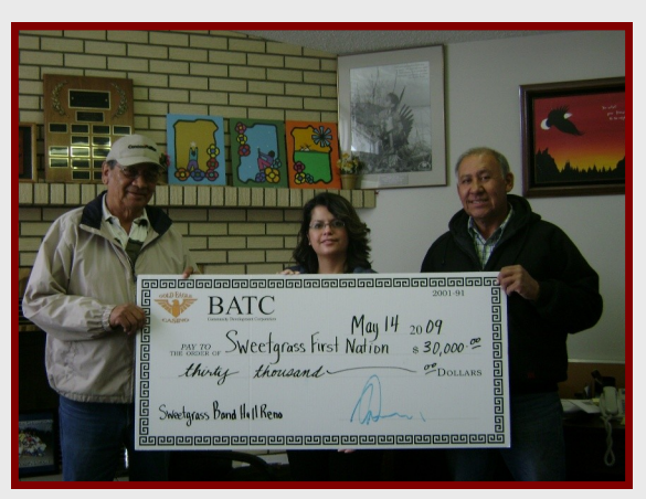
Sweetgrass Band Hall Renovations Sweetgrass First Nation