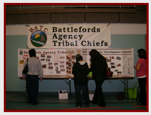
Treaty Day Displays 2009