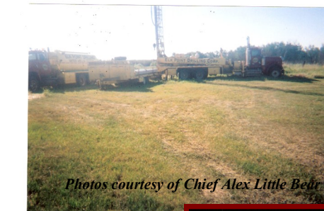
Water Harvesting Project Big Bear First Nation