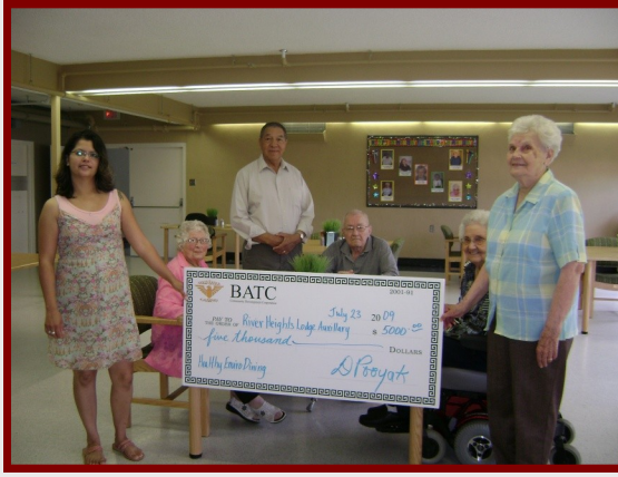
Healthy Enviro Dining River Heights Lodge Auxillary