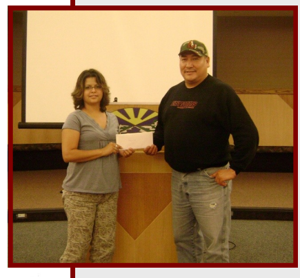
Pasqua First Nation