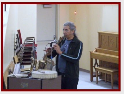
Aboriginal Storytelling North Battleford Library