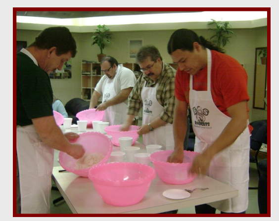
School Year End Trips Fundraising Battleford Central School