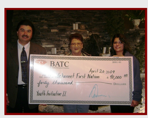
Youth Initiative II Nekaneet First Nation