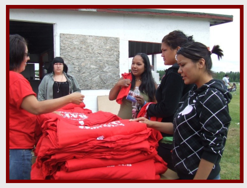
Ahtahakakoop Sports Day Ahthakakoop First Nation