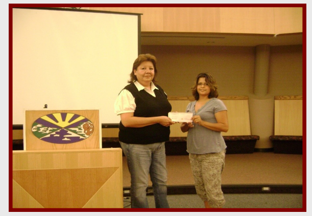
Wood Mountain Lakota First Nation