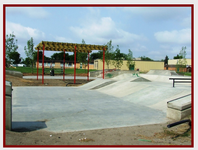
North Battleford Skate Park North Battleford Bonaventure Lions Club