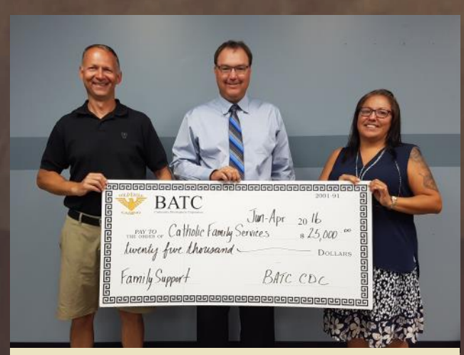
Catholic Family Services of the Battlefords Family Support Services