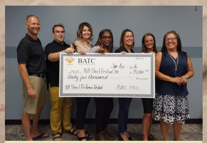
NB Street Festival Inc. NB Street Performer Festival