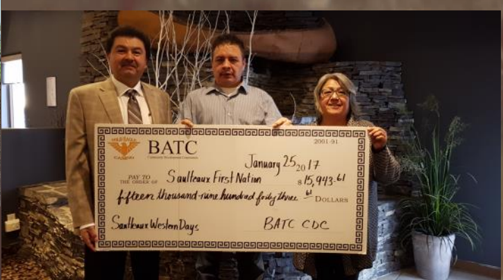
Saulteaux First Nation Saulteaux Western Days