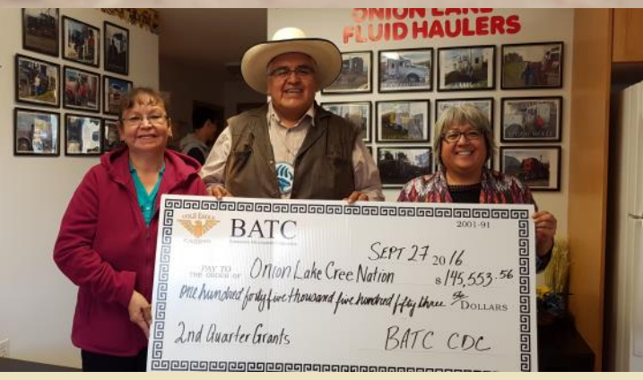
Onion Lake Cree Nation 2016-17, 2nd Quarter Projects