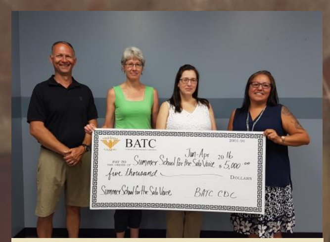
Summer School for the Solo Voice Summer School for the Solo Voice 2016