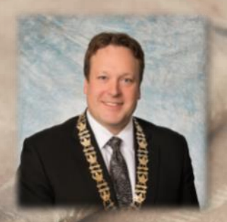
Mayor Ryan Bater City of North Battleford