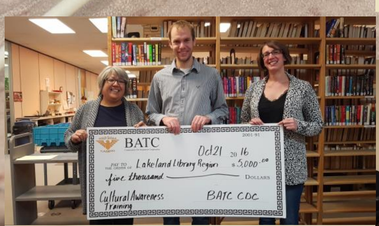
Lakeland Library Region Staff Development Training