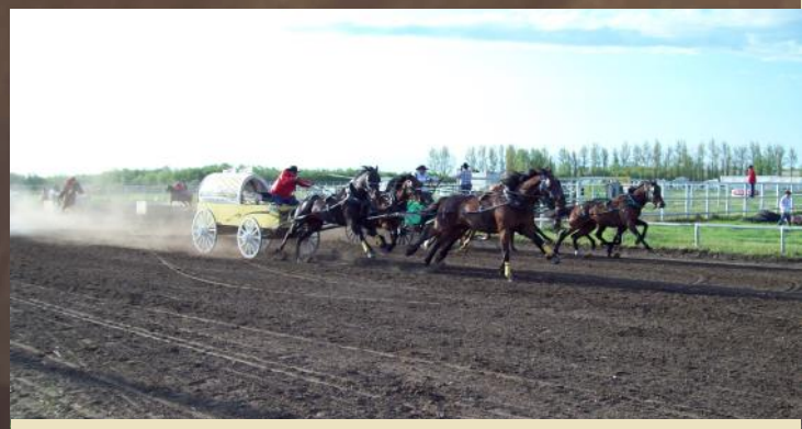
Battlefords Agricultural Society Canadian Professional Chuckwagon Races