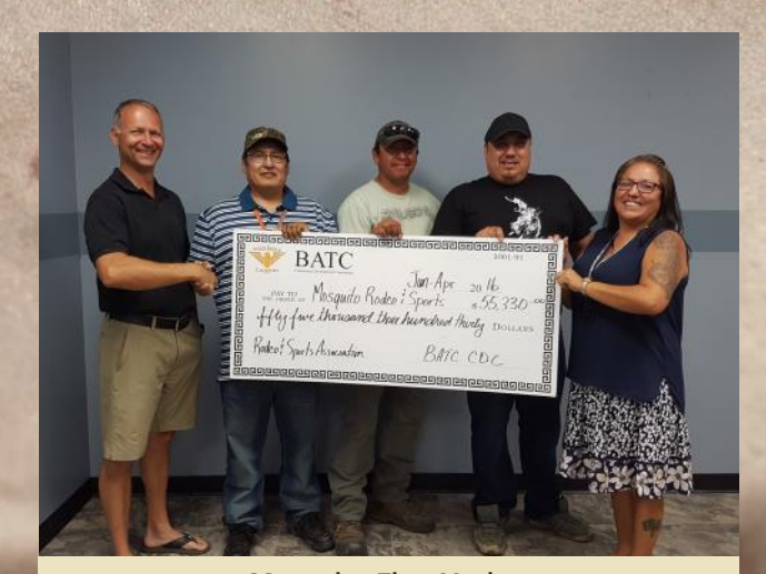
Mosquito First Nation Mosquito Rodeo & Sport Association