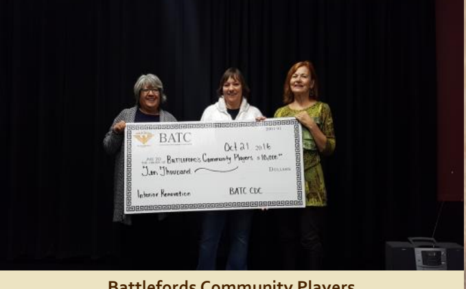
Battlefords Community Players Interior Renovations